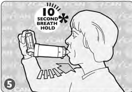
5 SLOW DEEP BREATH IN & HOLD