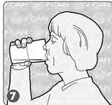
7 DRINK OR BRUSH TEETH