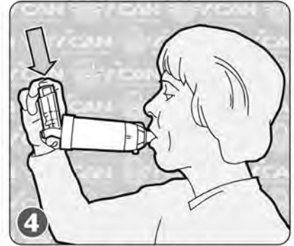
4 PRESS DOWN